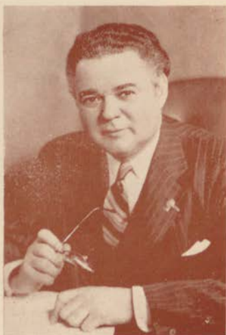
Senator C. Wayland Brooks Illinois