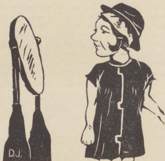
"Her weakness was hats"