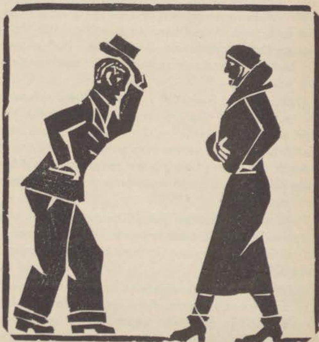
"Conscientiously and rather awkwardly"

But even then in the dim light he did not recognize that they were robbers. In about a minute he heard the last click of the combination. As the heavy doors of the vault swung slowly open, a light automatically went on inside the vault. The robbers hurried inside to grab the loot and get away with it. When Phillips with the aid of the light saw who they were, in a wild frenzy he closed the doors.