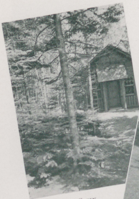
CHILDREN'S CABIN The really woods is the place to be With all outdoors and you and me.

A "WEE" CAMPER "Ye see ye can make yer own weather and fill it with sunshine if ye only know how."