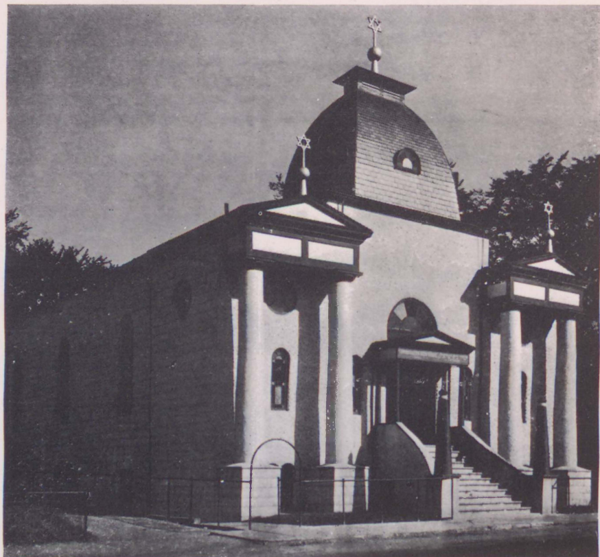
Beth Israel Synagogue Home of the Hebrew School from 1913-1920