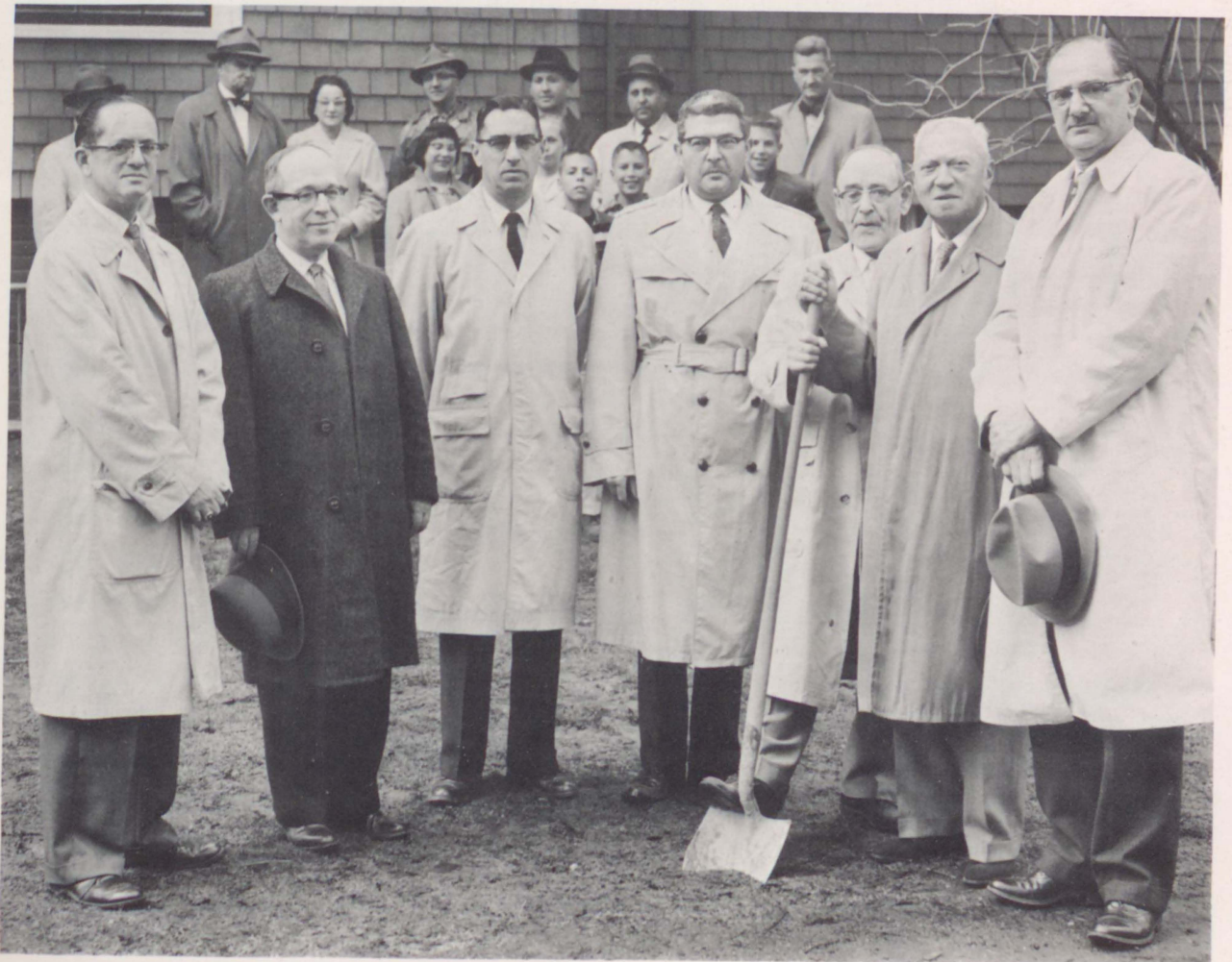
Ground Breaking Ceremonies April 1960