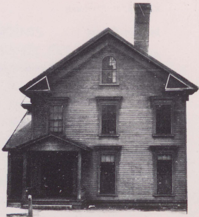
Bangor Hebrew School 1920-1938