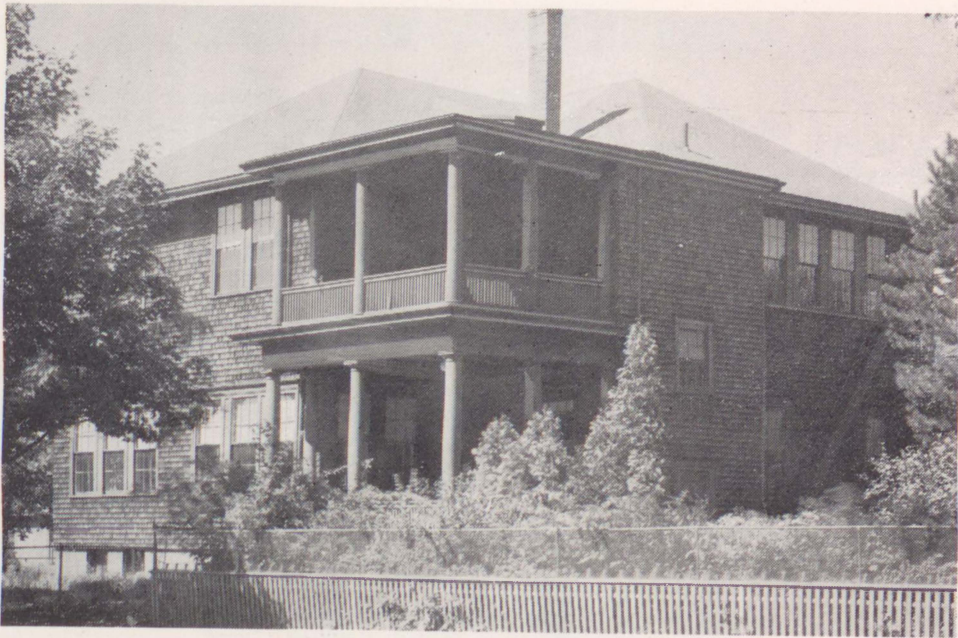
LISS MEMORIAL BUILDING