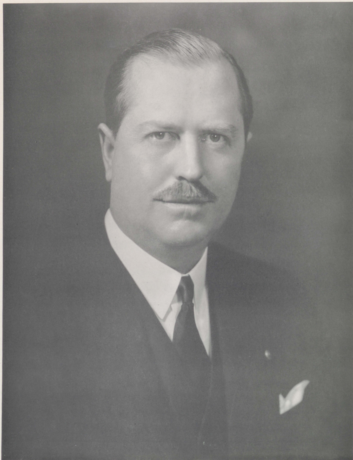
GOVERNOR SUMNER SEWALL