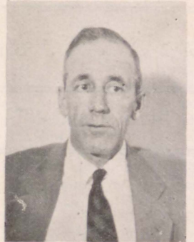
GROSE, Old Town.