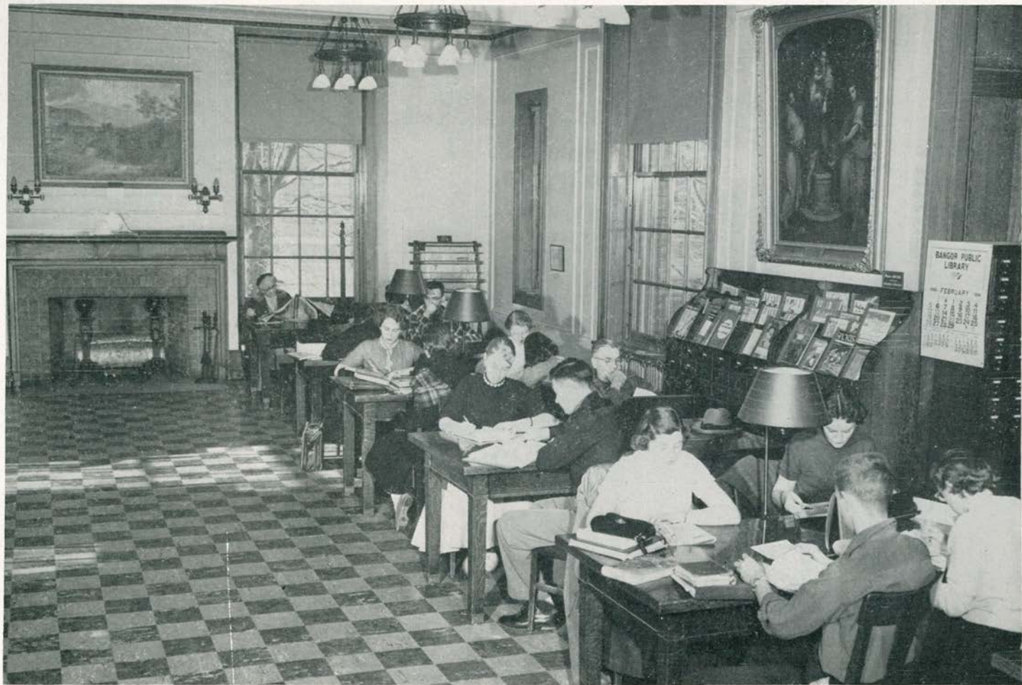
East side of the main reading room of the Bangor Public Library on a winter afternoon.