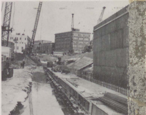
FEBRUARY, 1962 Erecting Form For First Section of West Wall