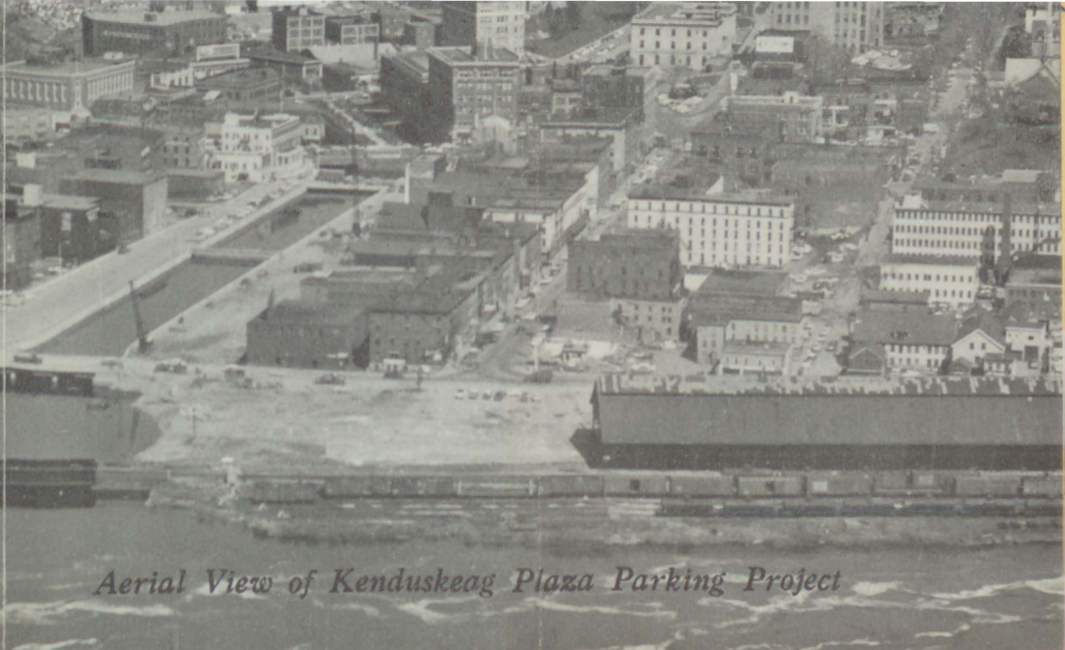
Aerial View of Kenduskeag Plaza Parking Project