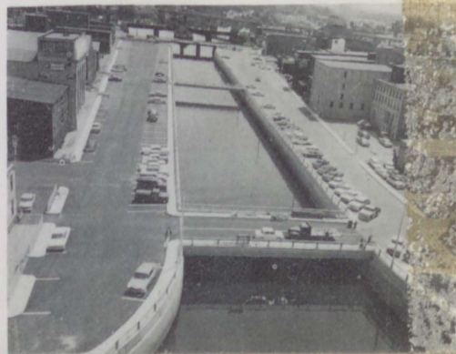
JUNE, 1963 Completion of Kenduskeag Plaza Parking Project