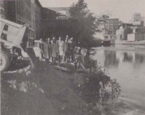
OCTOBER, 1961 Start of Construction of Kenduskeag Plaza