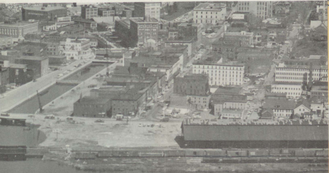
Aerial View of Kenduskeag Plaza Parking Project