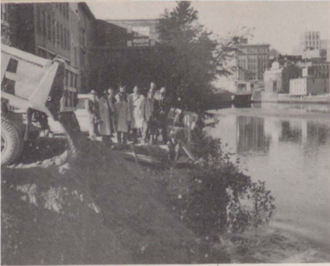
OCTOBER, 1961 Start of Construction of Kenduskeag Plaza