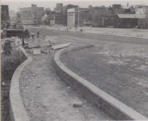
OCTOBER, 1962 Hot Topping Started on West Side